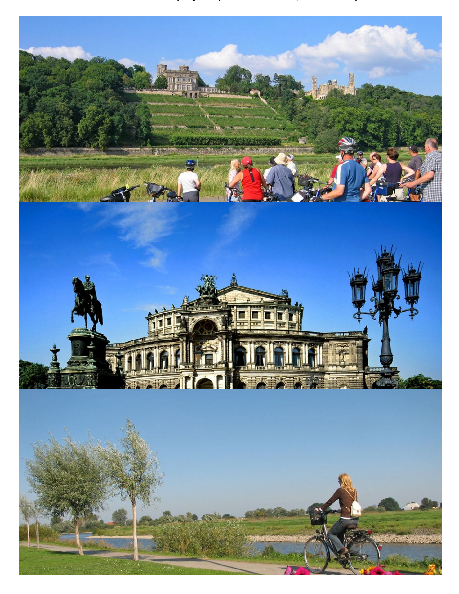
Elbe Cycle Path: Dresden to Dessau